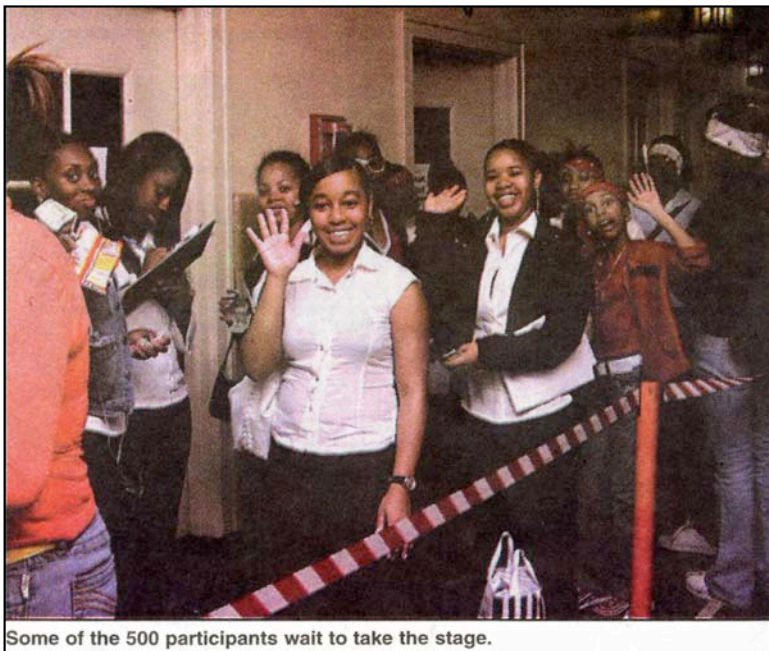
Some of the 500 participants wait to take the stage.

volunteers — manage all aspects of the event including the lights, the sound, security, ticket sales, outreach and publicity.